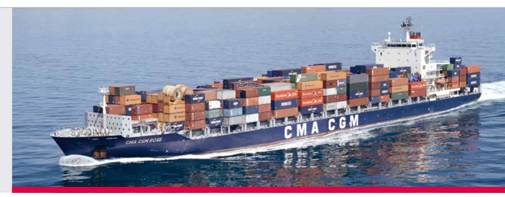
Onboard SEA-Mate® B2000 Blending System

The SEA-Mate® M3000 Analyzer utilises a bar code method of identification of both the sample point and the sample bottle. This eliminates the risk of mislabeling samples and greatly expedites the sampling process.