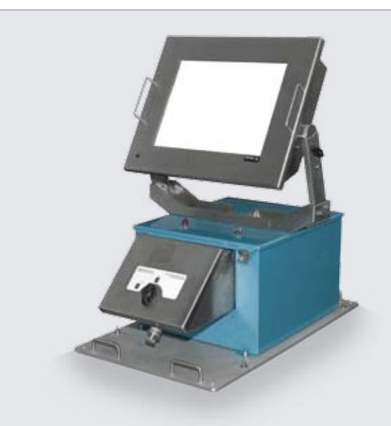
Fig. 2: SEA-Mate® M3000 Fluid Analyzer

The patented XRF technology is incorporated with the SEA-Mate® B2000 Blending System to help evaluate the cylinder condition and identify any potential problems within 6 minutes, so that corrective action can be taken. Analysing the scrape-down oil from each cylinder liner provides the crew with an accurate and virtually real-time understanding of cylinder lubrication condition. It has been proved that increases in wear debris can be detected by XRF as soon as 24 to 48 hours before the situation reaches the point that activitaes the temperature alarm.