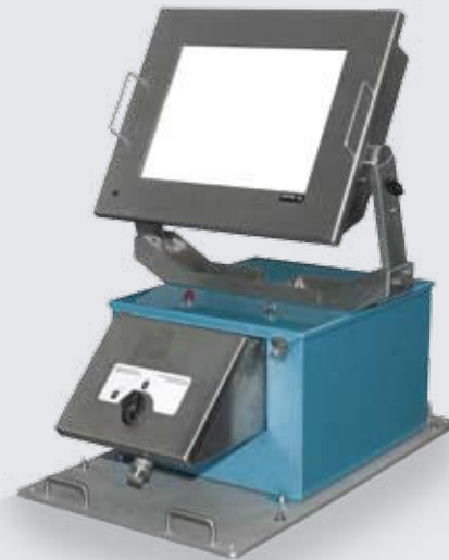
Fig. 2: SEA-Mate® M3000 Fluid Analyzer

The patented XRF technology is incorporated with the SEA-Mate® B2000 Blending System to help evaluate the cylinder condition and identify any potential problems within 6 minutes, so that corrective action can be taken. Analysing the scrape-down oil from each cylinder liner provides the crew with an accurate and virtually real-time understanding of cylinder lubrication condition. It has been proved that increases in wear debris can be detected by XRF as soon as 24 to 48 hours before the situation reaches the point that activates the temperature alarm.