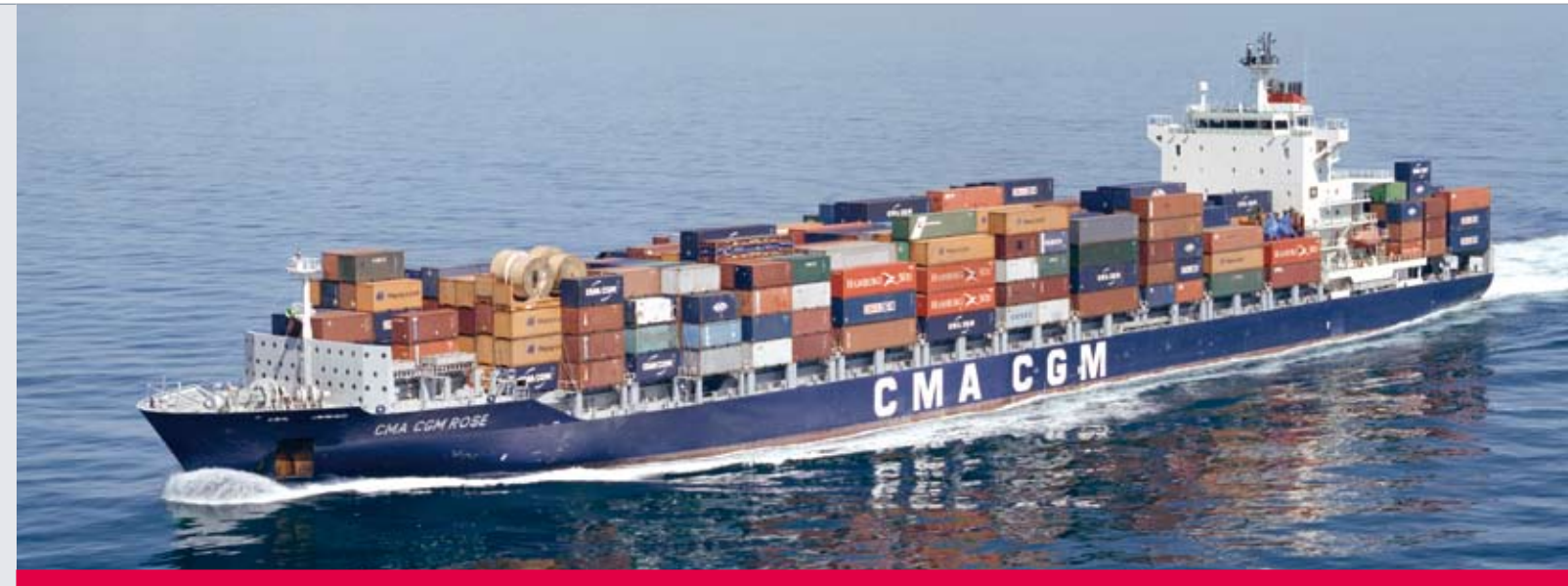
Onboard SEA-Mate® B2000 Blending System